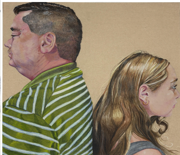
Two Sides of the Same Coin by Addison Dressel, 12th Grade Gold Key: Drawing & Illustration