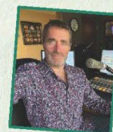
MUSIC BY: DJ Greg Mack!

Kids, bring your bikes for a fun and interactive night of bicycle activities in celebration of NATIONAL BIKE TO SCHOOL DAY